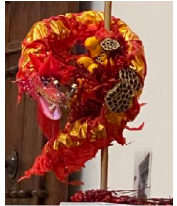
Hong Kong exhibit

These were beautiful and varied, my favourite was from Hong Kong for the Chinese New Year - an amazing dragon. We had designs depicting local landscapes and to the stunning Belgium design “a black hole “.