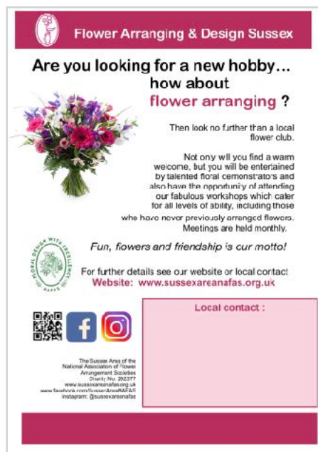
The Area 'hobby' poster

Is there a local groups event, or a mindfulness / activities event , promoting local activities, your club might be able to have a stall, or even have a stall to sell, or show how to flower arrange. Don't forget your leaflets to hand out.