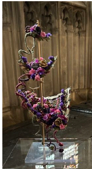
Linda Porrett Class 7 - First

And, I must also say that all of the entries from Sussex Area team were superb and completed to a very high standard and I know they all put in a huge amount of work into their designs.