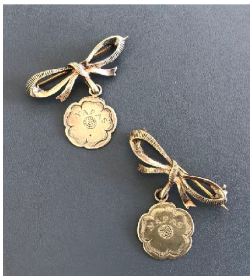
The Gold Ribbon

Historically, the National Show was held annually and at some shows there were two competitions in the same week, such was the enthusiasm of the competitors who applied, and all the classes were filled. It was not unknown to have 400 or more entries.