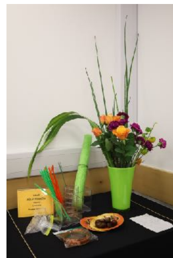
The provided items

All the competitors worked hard on their designs in the given time.