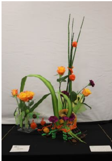
Very Highly Commended Carole Down