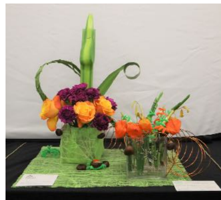
A Bit of This and That