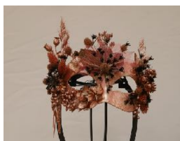
Best use of Colour Duncan Ward