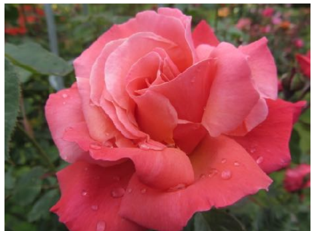
3. Best in Show Duncan Ward