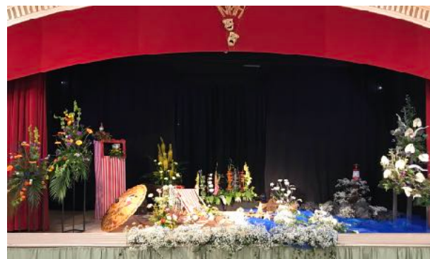
'Oh, I do like to be beside the seaside'

charity. This year was no different and £1,000 is being donated to each of the three chosen charities: Kent, Surrey and Sussex Air Ambulance, Care for the Carers and Target Ovarian Cancer.