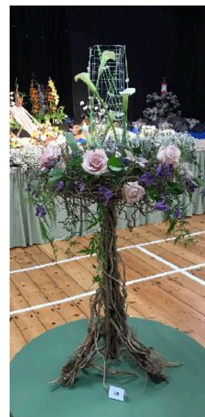
'Candle in the Wind'