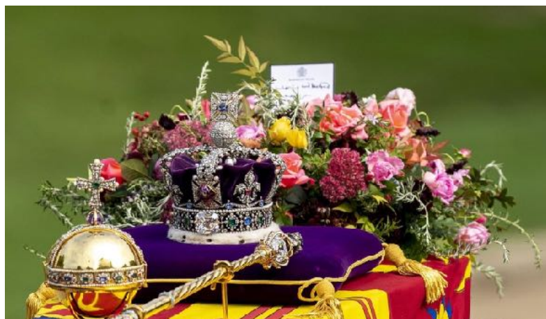
The funeral wreath