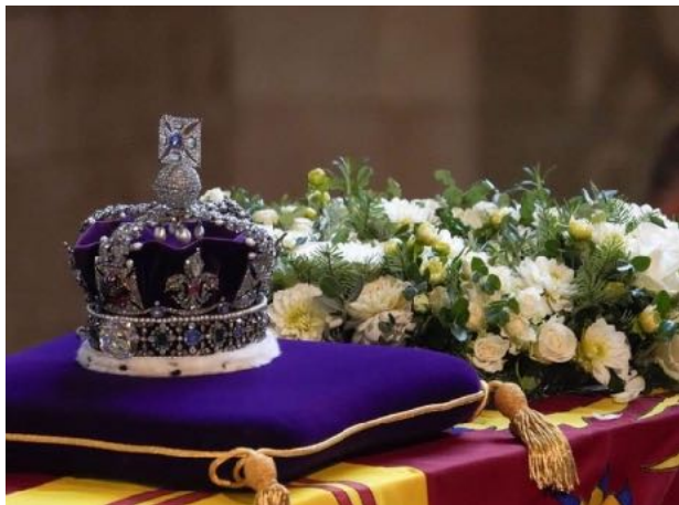
The lying in state wreath