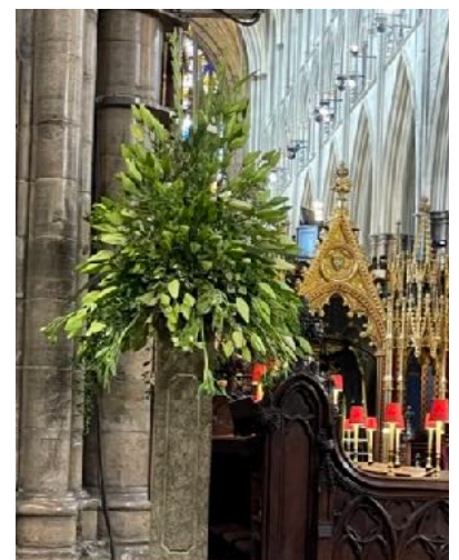
The flowers on Friday

We were staging on Friday, 16 September. There was a little concern about the lilies. I'm sure you can understand the angst. Would they come out? Would they still be in tight buds 3 days hence? What about the stamen? Can you imagine the look