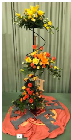
'Always look on the bright side of life'

Ninfield Flower Group has been celebrating its 45 th Anniversary with a Festival entitled 'Flowers go Pop'. With arrangements based on popular songs varying from 'Oh, I do like to be beside the seaside', 'Singing in the Rain', through to 'Let's twist again', 'Mamma Mia' and on to rather more recent songs 'Happy' and 'Wired for Sound'. A wide range of titles for a group of many talents and experience.