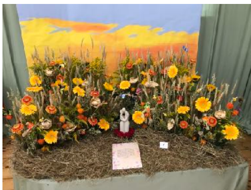
'Fields of Gold'

Money is raised through jumble sales before festivals to enable most of the income to